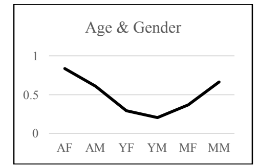
Figure 3 The age & gender effect in the distribution of –tou

In our data, the vernacular form, i.e. the suffix -tou shows the lowest percentage among people who are in their twenties, suggesting the role played by the linguistic market as the standard form, i.e. -mian is much preferred in the working environment, given that Putonghua has become the main working language nationwide. As for those who are the youngest and the oldest in our sample, social pressure reduces as they are still in school or out of the workforce, rendering the non-prestigious form resurface (Cheshire 2005: 1555; Downes 1998: 24; Labov 1994: 73).