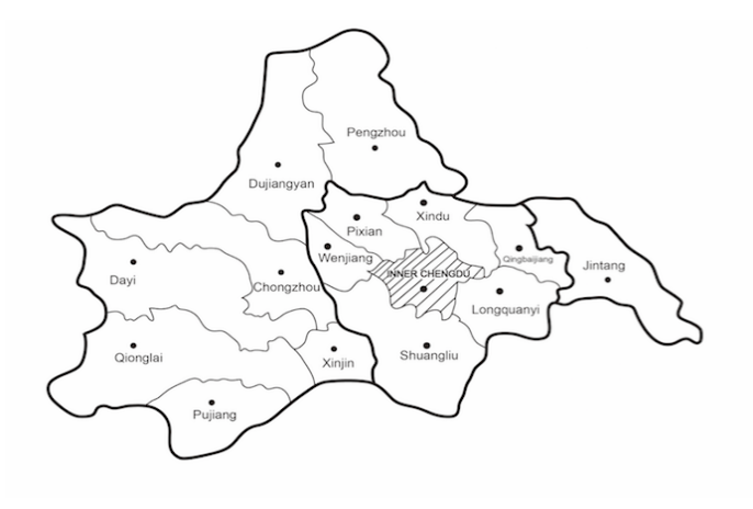
Figure 1 Administrative Landscape of Chengdu

Chengdu, located in mid-Sichuan Southwest China, serves as the capital of Sichuan province, and has developed into one of the most important economic, commercial, cultural and education centers in Western China. Chengdu enjoys a long history of over 2,300 years and has been known as one of the ancient cities in China. During the history, it has gone through several changes in its jurisdictions and has been shaped into an administrative landscape of 11 districts, 4 county-level cities and 5 counties, far expanded than its original 3 major districts (Jinniu district, Xicheng district and Dongcheng district) (see Figure 1). Resulting from modernization and constant influx of people, the population of Chengdu has increased from the initial several million to more than tens of million. According to the data from the 2010 census promulgated by the government, there would have been more than 12,000,000 inhabitants living in Chengdu by the end of 2015, with the population ranking the fourth nationwide only after Beijing, Shanghai, and Chongqing. Noticeably speaking, the number of people coming from other places has far surpassed that of those indigenous people in Chengdu given the fact that more than 80% people living in Chengdu have migrated from other cities in and outside Sichuan province. It is therefore not hard to imagine a great possible impact of the social change upon the use of Chengdu dialect.